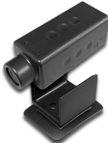
OPS HD Clip Mount

You may rotate your OPS HD inside the mount in order to keep your video at the correct orientation.