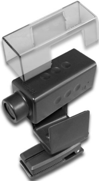
Impact Armor OPS HD Clip Mount

Snap your mounts together. Align and lock them with the three bubbles and dimples.