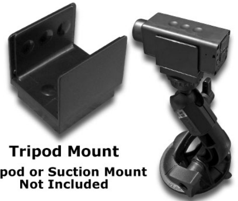
Tripod Mount Tripod or Suction Mount Not Included

You may rotate your OPS HD inside the mount in order to keep your video at the correct orientation.